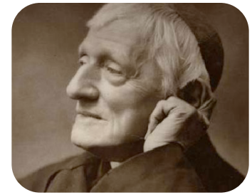
Blessed John Henry Cardinal Newman 1801-1890